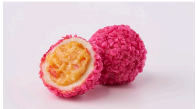
Lychee Shaped Fried Salad Ball 爆汁荔枝球