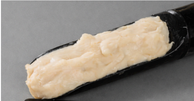
Squid Paste 花枝風味漿