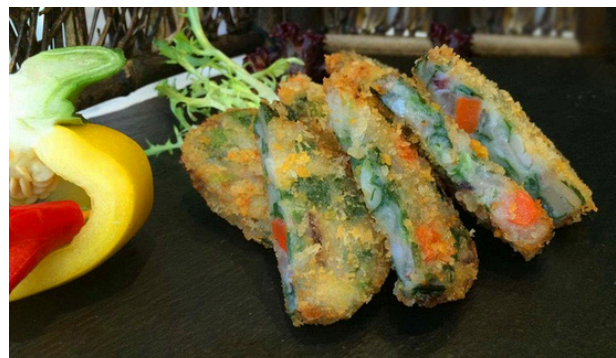
Chives Flavor Squid Cake 韭菜魷魚餅