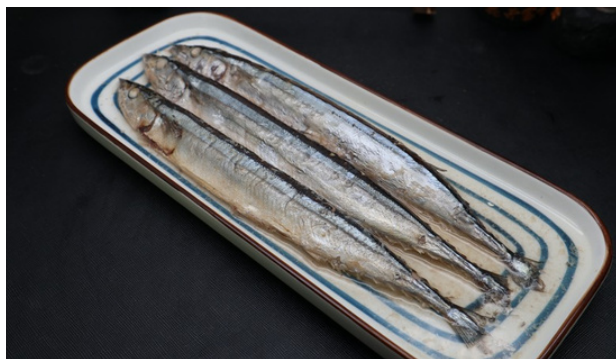
Tsukudani Saury 佃煮秋刀魚