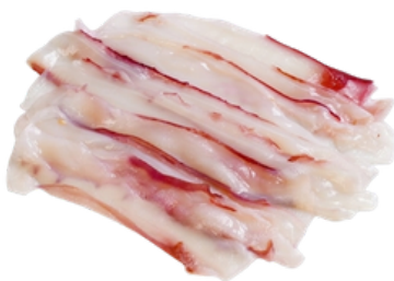
Hot Pot Squid Tentacles Slice 紙片魷魚