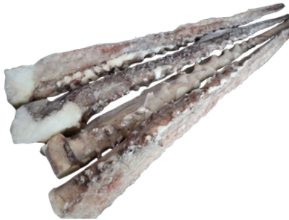
Squid Tentacles. Single Cut 魷魚腿. 單支