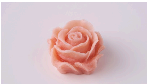
Rose Shaped Surimi 魚糕玫瑰