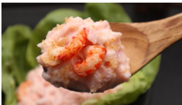
Crawfish Salad 龍蝦風味沙拉