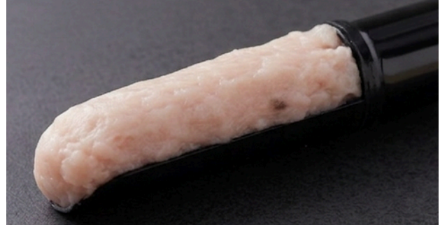
Shrimp Paste 蝦滑