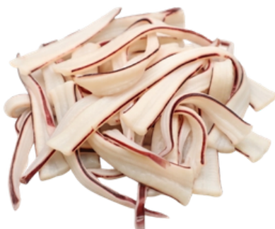
Squid Threds. Thin/Thick 魷魚絲. 細切/厚切