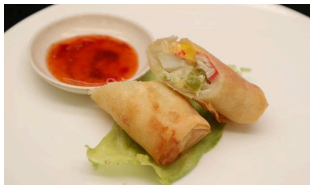
Seafood Roll 泰式沙律卷