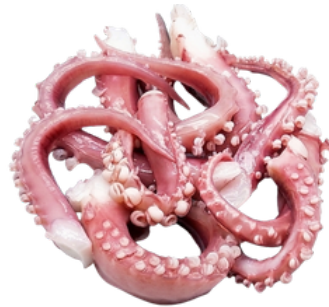
Crispy Squid Tentacles 脆口魷魚須