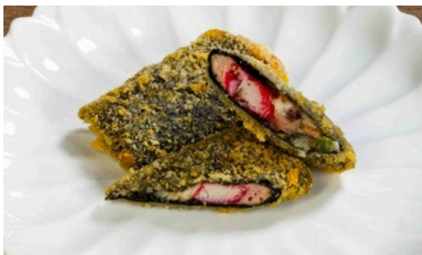
Snow Crab Flavor Roll 松葉蟹味卷