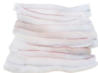
Hot Pot Squid Wing Slice 火鍋魷魚