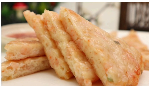
Moon Shrimp Cake 月亮蝦餅