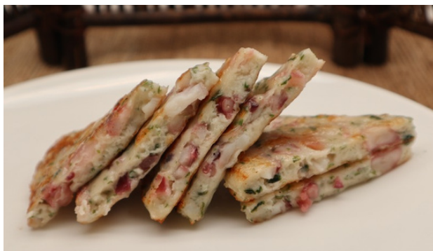
Moon Squid Cake 月亮章魚風味餅