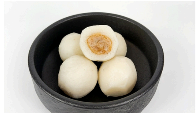
Squid Stuffing Fishball 魷魚餡福州丸