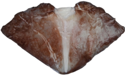
Squid Wings. Skin On/Off 魷魚翅. 帶皮/去皮