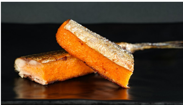
Mentaiko Saury 明太秋刀魚