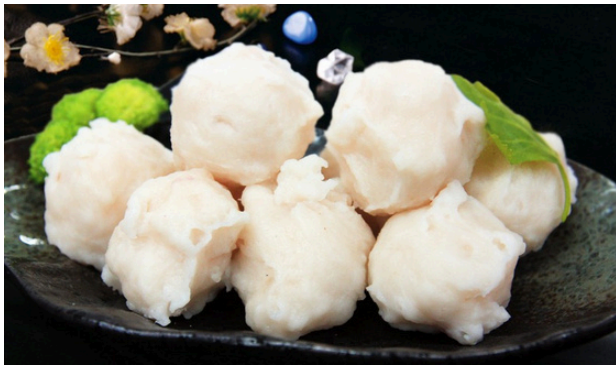
Cuttlefish Flavor Fishball 花枝風味丸