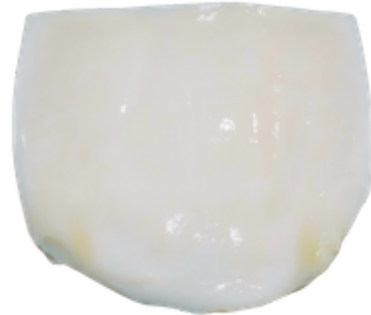
Squid Fillets 魷魚肉片